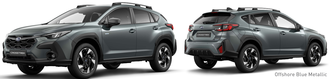
Offshore Blue Metallic

2.0i CROSSTREK TOURING AWD ON THE ROAD PRICE: £38,100