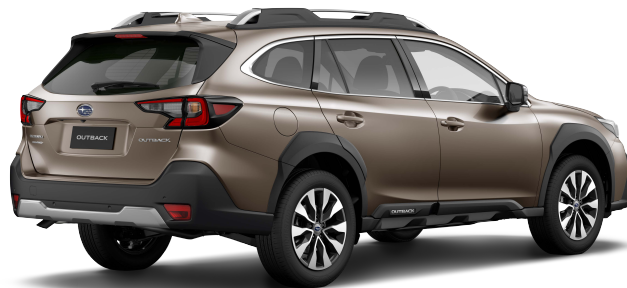
Brilliant Bronze Metallic