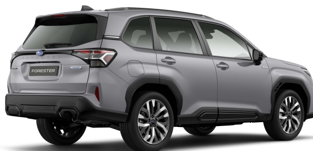
RIVER ROCK PEARL