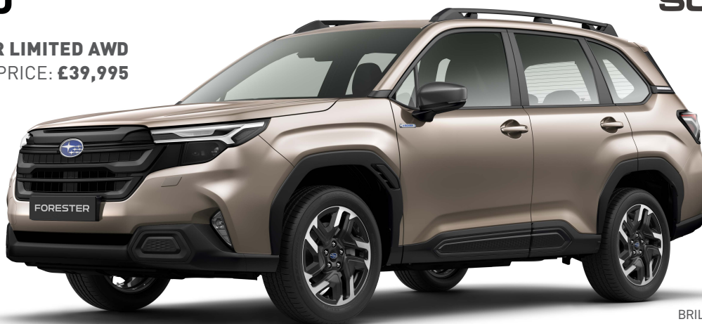
BRILLIANT BRONZE METALLIC