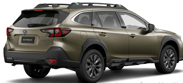
Autumn Green Metallic