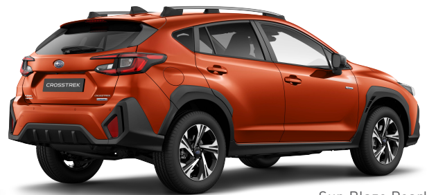
Sun Blaze Pearl