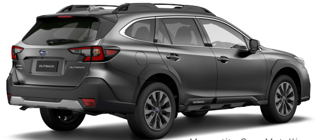
Magnetite Grey Metallic